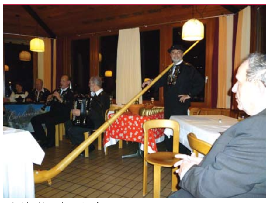
Social activies at the JMEC conference

rabbis, among others. Individual case studies, Jewish sources and unusual ethical dilemmas added to the interest of the sessions.