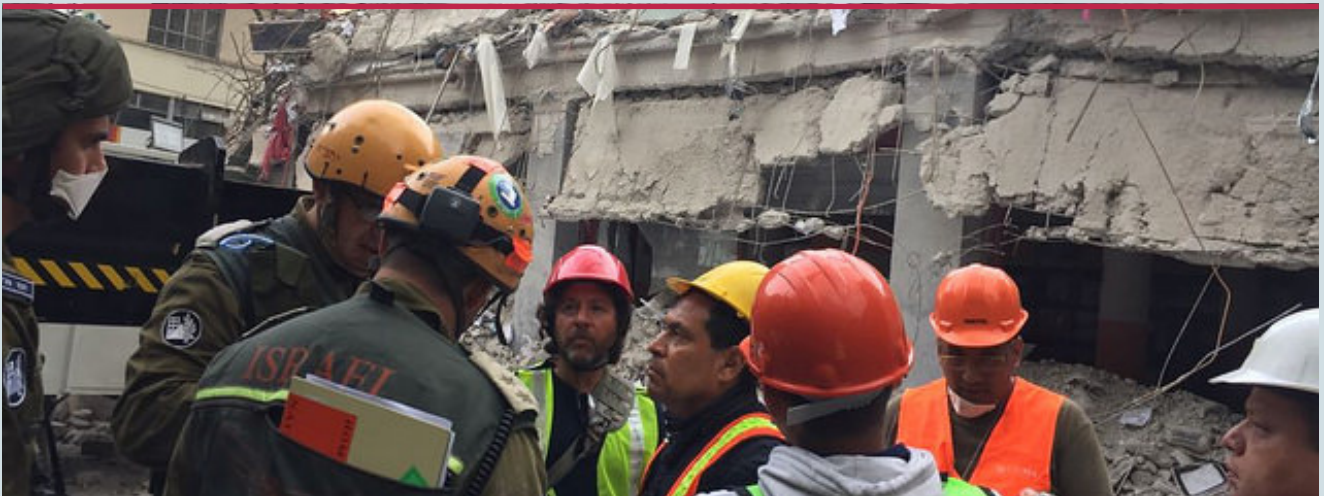
■ Israel’s Search and Rescue Unit at work in Mexico

“ Israeli delegation immediately joined the local teams in life-saving efforts