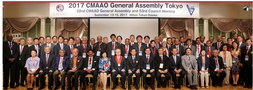
■ Participants at the 2017 CMAAO General Assembly, Tokyo