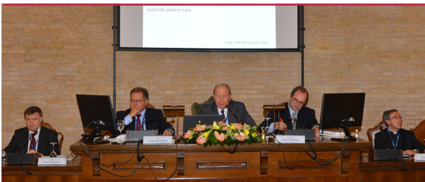
■ Participants at the 2017 CMAAO General Assembly, Tokyo