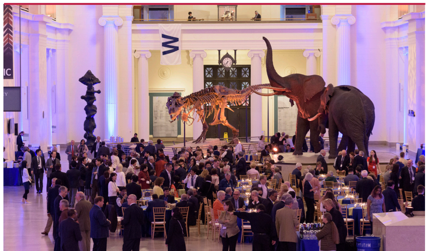
■ WMA Dinner at the Field Museum