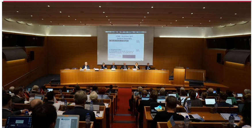
■ CPME GA which took place in the International Auditorium, Brussels

The Standing Committee of European Doctors (CPME) represents national medical associations across Europe. They are committed to contributing the medical profession’s point of view to EU institutions and European policy-making through pro-active cooperation on a wide range of health and healthcare related issues.