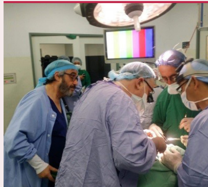
■ 2017 Medical Mission to Fiji

Our annual movie night was well attended and members enjoyed a preview screening of the film, Bye