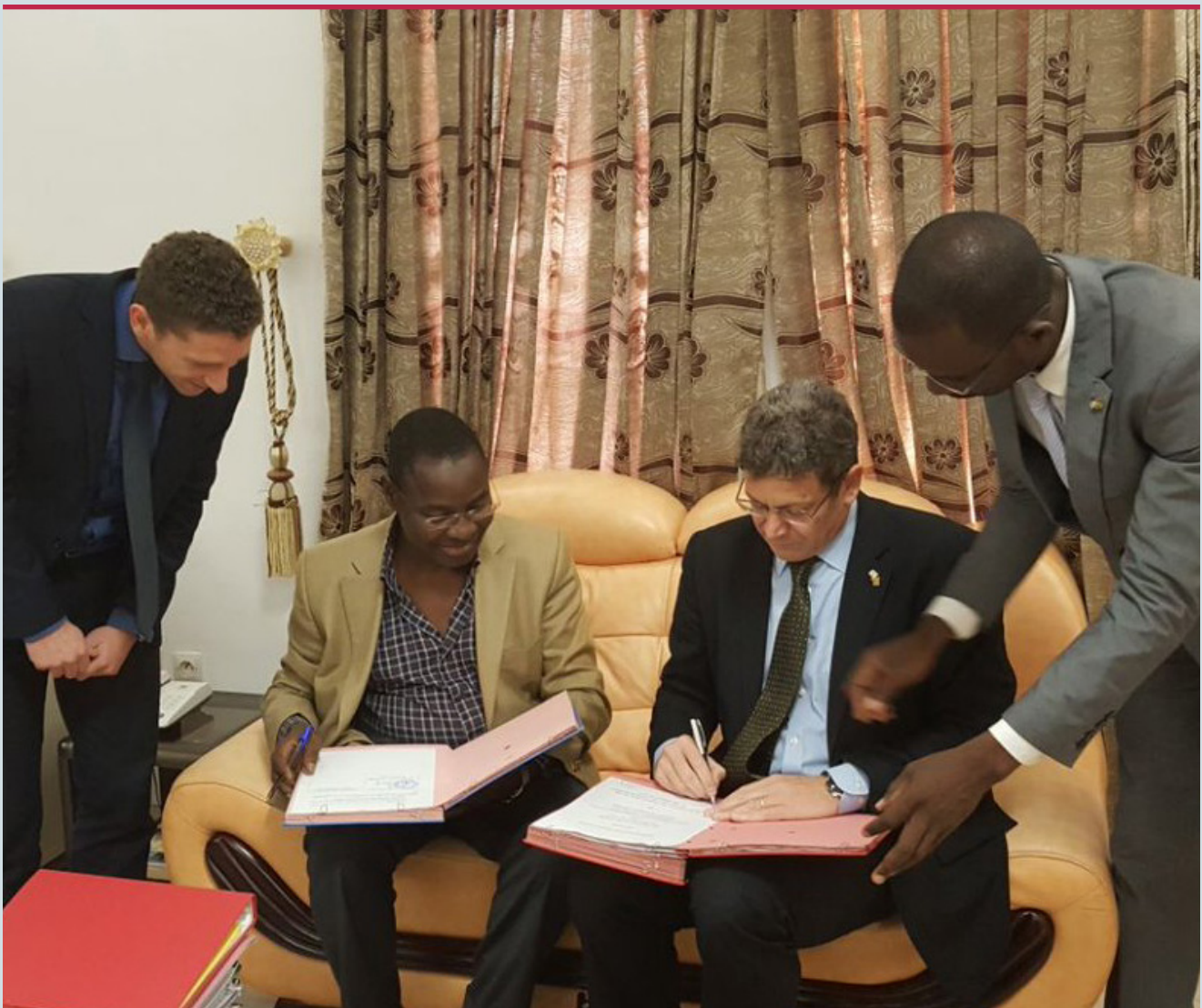
■ Signing MOU for the establishment and installation of an Emergency and Trauma Unit