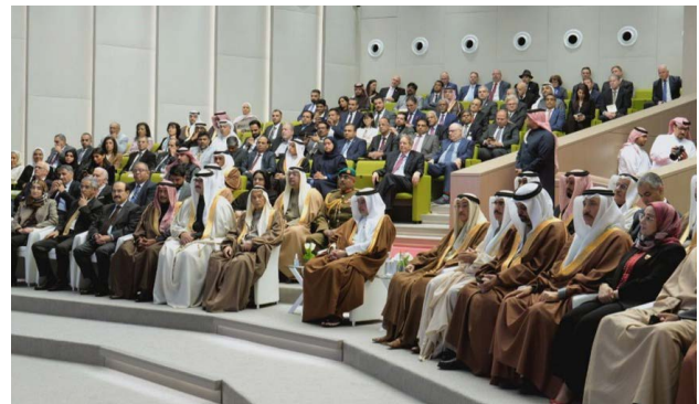
The audience at the inauguration of King Hamad American Mission Hospital in Manama, Bahrain.

https://www.israel21c.org/israeli-medical-innovation-hub-opens-in-bahraini-hospital/