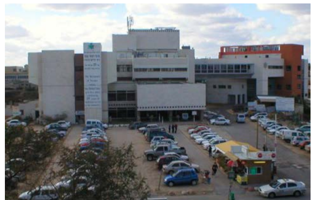
Laniado's Maternity Wing.

In the words of the Rebbe ztzk"l: A hospital will provide help to every person and it will be help that comes from the heart, not purely technical help. The hospital will work professionally without forgetting the most important aspects: kindness, a warm attitude, caring and empathy for the patient.