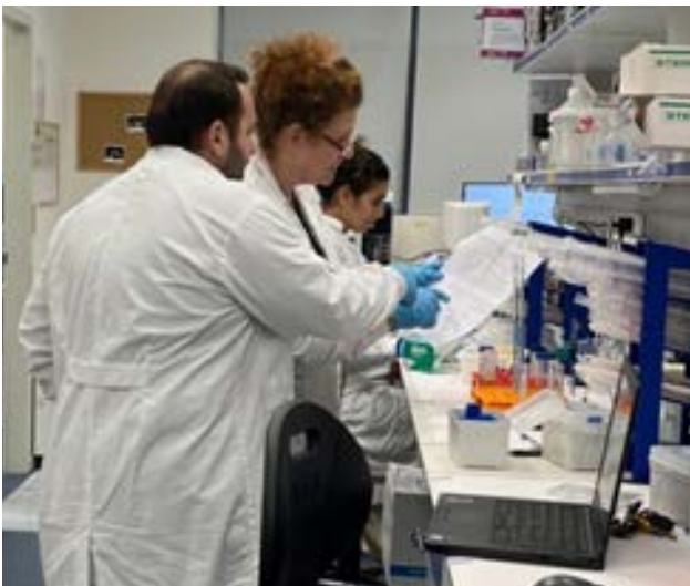
Minovia Therapeutics employees at the lab bench.

Link to the full article: https://www.israel21c.org/new-cell-therapy-may-be-key-to-curing-disease/