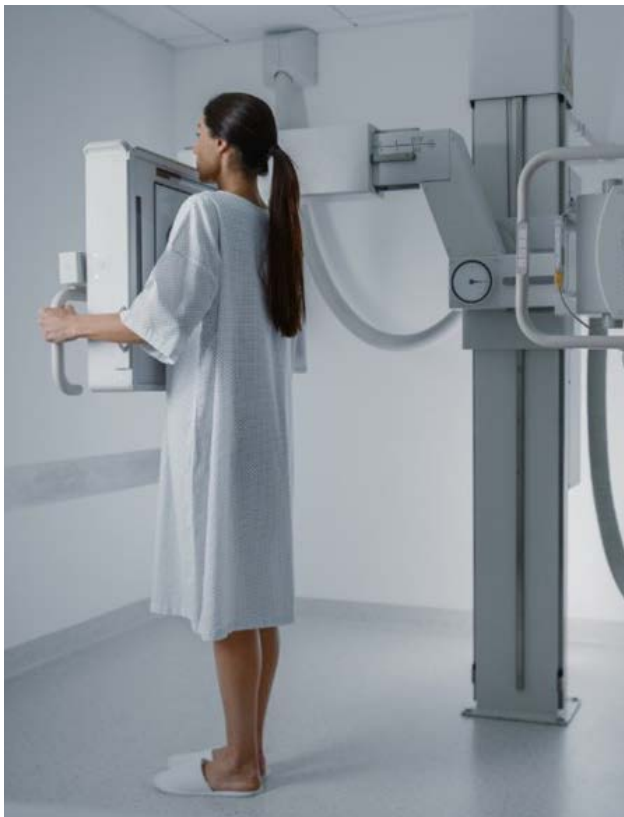
Illustrative image by Gorodenkoff via Shutterstock.com