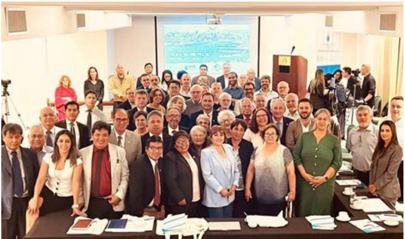
CONFEMEL General Assembly, Punta del Este, Uruguay, 2023.

The next assembly will be held in August and will be hosted by Mexico. The Israeli Medical Association has been invited to attend.