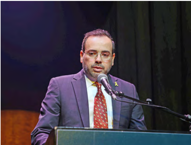
Uriel Bosso Minister of Health.

The 2024 Mental Health Conference organized by the Enosh Association took place at the beginning of September, with the theme of "Operation Swords of Iron." Health Minister Uriel Busso addressed the Ministry of Health's plans in light of the current situation. "Over the past year, we have been leading the National Mental Health Program with unprecedented budgets and intensive work... In these challenging and emotional times, marked by tension and disagreements on a personal level, we are turning mental health into a national mission. We will lead a deep systemic reform."