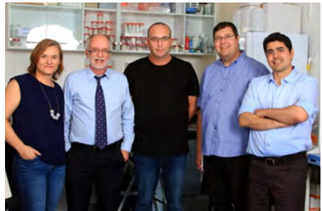
Salignostics' founding team in Jerusalem.

Israeli startup Salignostics, in partnership with Sheba Medical Center, is developing a saliva-based test for early detection of oral cancer. The test leverages Salignostics' existing saliva processing technology, which has already been used in home pregnancy and COVID-19 tests. Saliva's direct contact with infected tissue makes it a valuable tool for detecting disease markers early, potentially improving survival rates. If successful, the platform could expand to diagnose other cancers, enhancing early diagnosis and treatment outcomes.