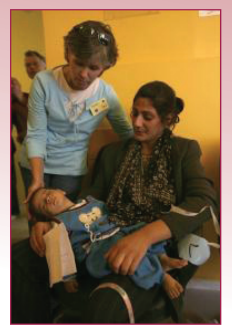
An Iraqi child treated by an Israeli doctor in Jordan

work would help improve relations between the two nations and ease tensions between Israel and the rest of the Arab world.