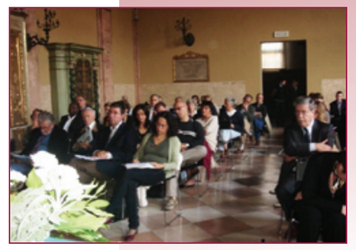
The AME at the conference held at the Italian synagogue in Ferrara

Often the life of members of Israeli Diaspora in Italy is a niche of conflicts without the identification with the country that gives them hospitality and with the feeling of having abandoned a house in danger.